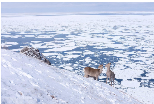
Further snowy adventures

Contact us for further information about our summer tours.